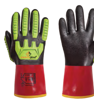
CHEMSTOP™ S15KGVNFVB S - XL

Cold weather hi-viz gloves with high cut resistance and a steady grip